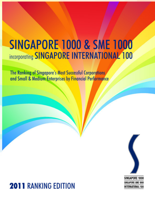
24th Ranking Edition

SINGAPORE 1000 SINGAPORE SME 1000 INTERNATIONAL 100