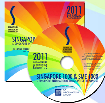
24th CD-Rom Edition