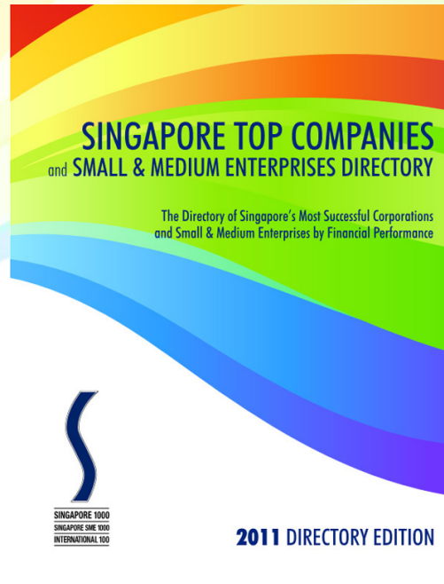
24th Directory Edition